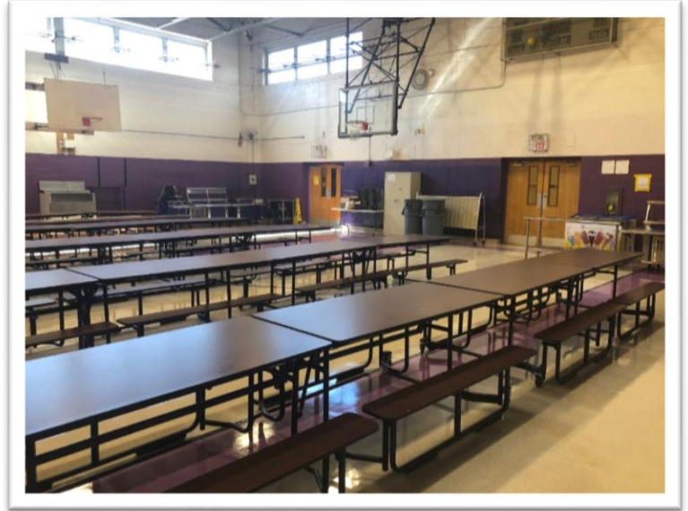
(Above) Temporary setup utilizing half of the Gym for breakfast and lunch service

Food service will be prepared at the Middle High School and transported to the Elementary school for lunch service. The menu will be limited for the month of September, however, there will be cold and warm food options each week. Currently the district's Elementary School menu for September shows cold lunches that will be available on a daily basis. Maschio's is working on providing hot lunches on select days of the week throughout the month of September. Once they have finalized their schedule, they will update the online menu, so please keep an eye on the district website for changes. Please visit the website for the daily lunch menu . We ask for your patience during this transitional period as the project moves towards completion. We look forward to having a brand new cafeteria and kitchen that allows us to serve larger variety of food to our students in the near future.