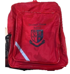
Red rucksack from the School shop