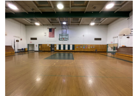
Kakiat ES Gymnasium Floor