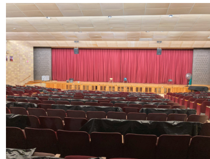
Ramapo HS Auditorium