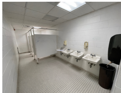
Pomona MS – Existing 2 nd Floor Girls Toilet Room