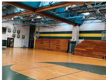
Ramapo HS Gymnasium Floor and Bleachers