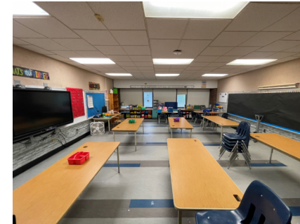
Elmwood ES Classroom 201