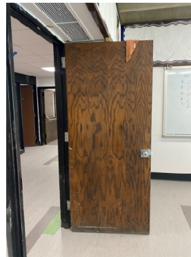
Pomona MS Typical Classroom Door