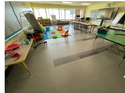
Hempstead ES Classroom 303