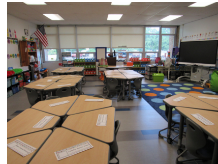
Summit Park ES Classroom