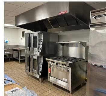
Grandview ES Kitchen