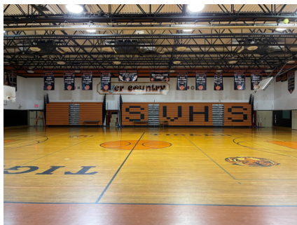
Spring Valley HS Gymnasium Floor and Bleachers