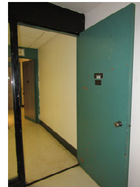
Eldorado ES Typical Classroom Door