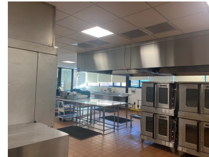
Chestnut Ridge MS Kitchen