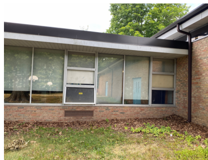
Fleetwood ES - Typical Window Configuration