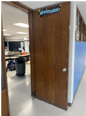
Grandview ES Typical Classroom Door