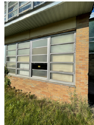
Hempstead ES - Typical Window Configuration