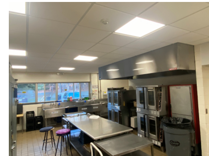
Margetts ES Kitchen