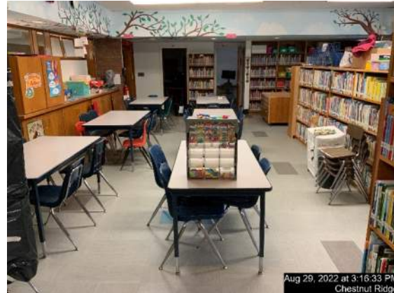
Margetts ES – Flooring Replacement Work – Progress Photos: New Flooring & Base – Installations