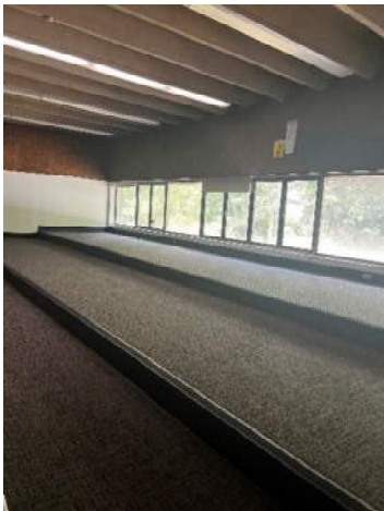
Pomona MS – Flooring Replacement Work – Progress Photos: New Flooring & Base – Installations