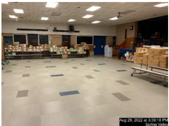
Elmwood ES – Flooring Replacement Work – Progress Photos: New Flooring & Base – Installations