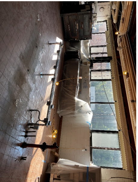
Chestnut Ridge Elementary School – Kitchen Hood & Equipment Renovation Work – Progress Photos: