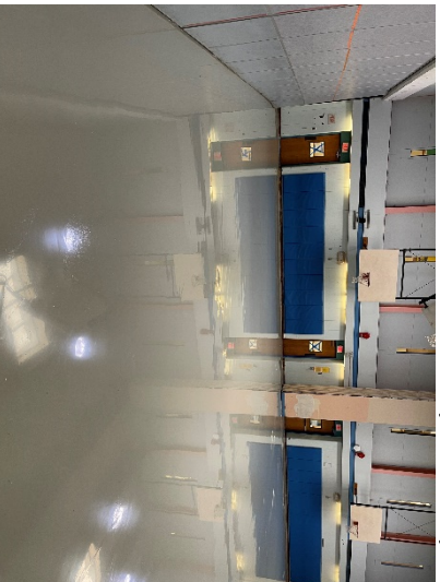
Elmwood ES – Kitchen Hood & Equipment & Gym Flooring Installation Work – Progress Photos: