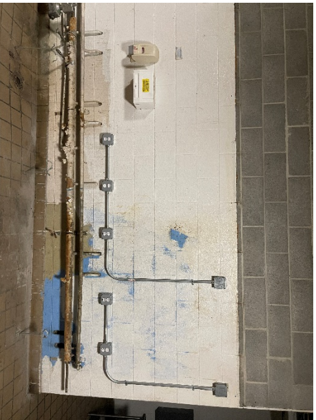
Pomona MS – Kitchen Hood & Equipment Installation Work - Progress Photos: