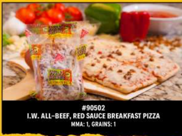
#90502 I.W. ALL-BEEF, RED SAUCE BREAKFAST PIZZA MMA: 1, GRAINS: 1