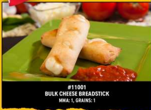
#11001 BULK CHEESE BREADSTICK MMA: 1, GRAINS: 1

PRODUCTS CURRENTLY ON THE MISSISSIPPI DEPARTMENT OF EDUCATION BID