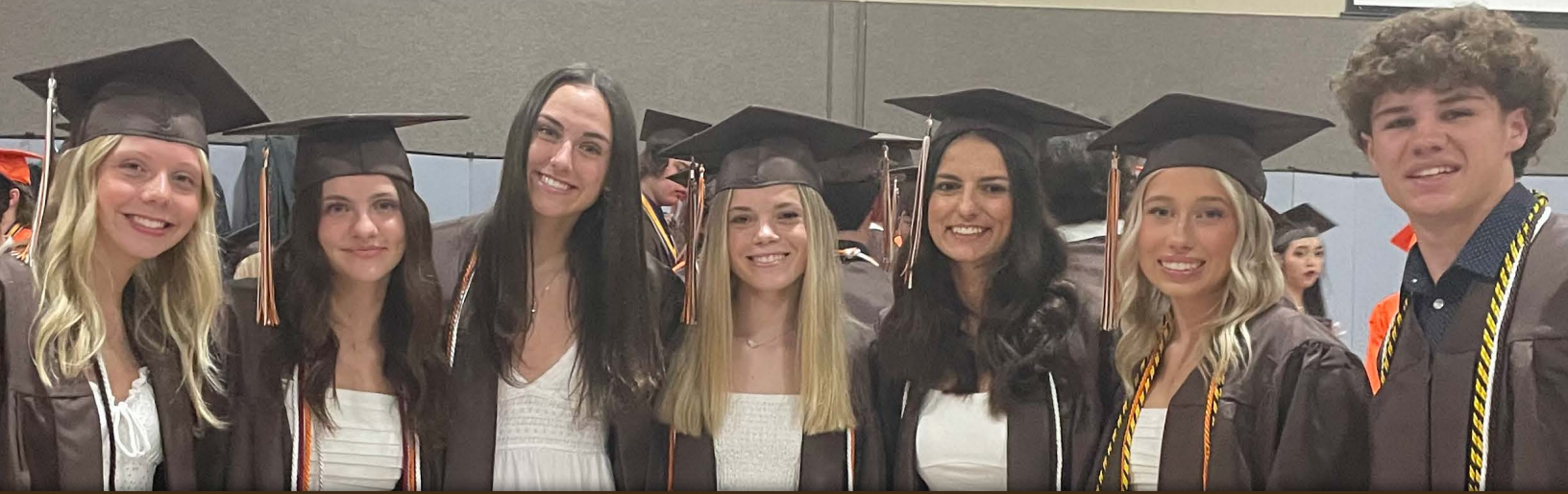
Members of the Class of 2024 were celebrated at the commencement ceremony on May 17th. Congratulations to all of our graduates!