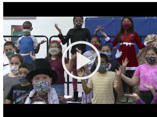
2020 Holiday Music Compilation