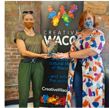
October - Creative Waco