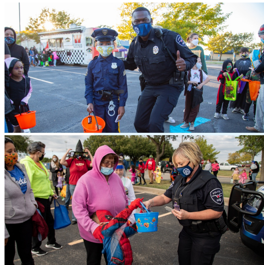
Waco ISD Police Department Trunk-or-Treat