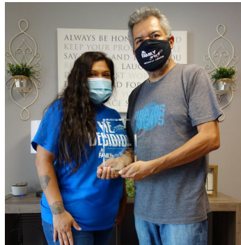
September - Family of Faith Worship Center