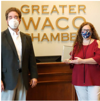
August - Greater Waco Chamber

Waco ISD is blessed to have scores of community partners who are deeply invested in our students, staff and their success. Each month, we recognize a community partner making a difference with the Waco ISD Award for Outstanding Community Partners.