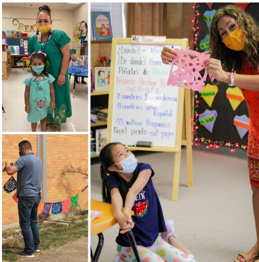
Hispanic Heritage Month

We look forward to continue celebrating holidays and milestones safely. Up next is Valentines' Day and the 100th Day of School!