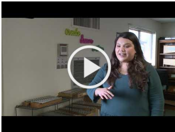
Music Program at Parkdale

Although we must practice social distancing, the last thing we wanted our families to feel was distant. This year we started a new series called Classroom Close-Ups. These videos provide an inside look at how our teachers are delivering engaging and quality instruction to our in-person and remote students. You can find the videos below and more on our Waco ISD Facebook page or YouTube channel . We look forward to bringing you into our classrooms!