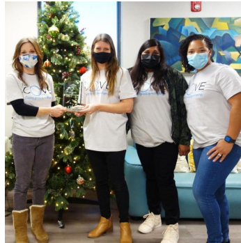
December - The Cove