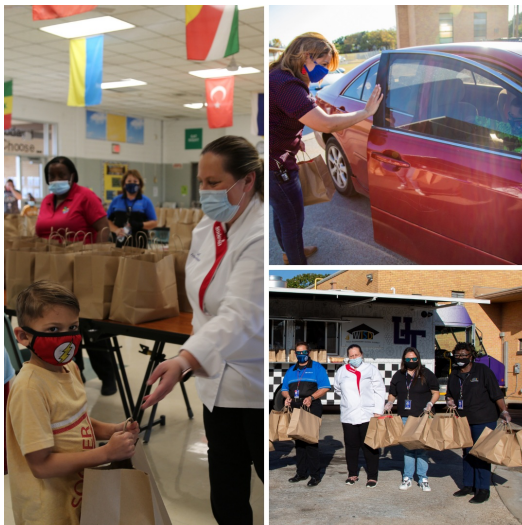
Thanksgiving Meals Provided by Waco ISD Child Nutrition Services