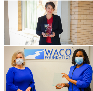
January - Cooper & Waco Foundations