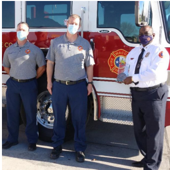
November - Waco Fire Department