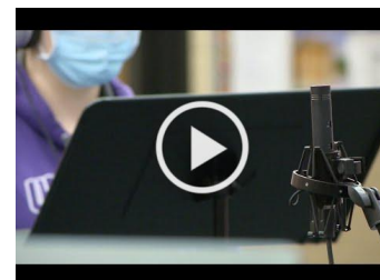
McLennan Community College

Does social distancing have you feeling out of touch? Check out our video series, Classroom Close-Ups! Above are just a few examples of how the community makes such an impact in our classrooms, even during these distant times. Click HERE for more videos!