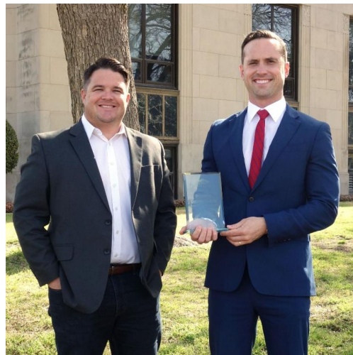
March - City of Waco