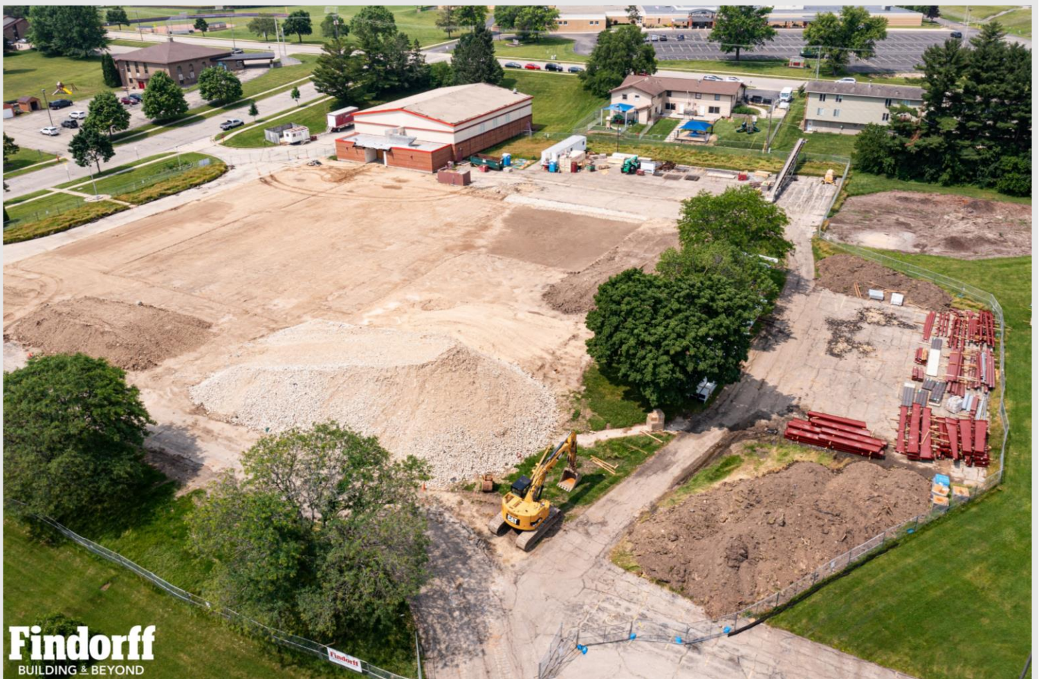
Above: an aerial of the Yahara Site captured by a Findorff drone flight on (6/18)

The existing Yahara Gym still stands and will continue to be a home for Viking athletics! Along with some minor mechanical, electrical, and plumbing (MEP) upgrades, the gym's main entrance will be refreshed with new finishes and doors to enclose the building along the elevation it was separated from the old elementary school.