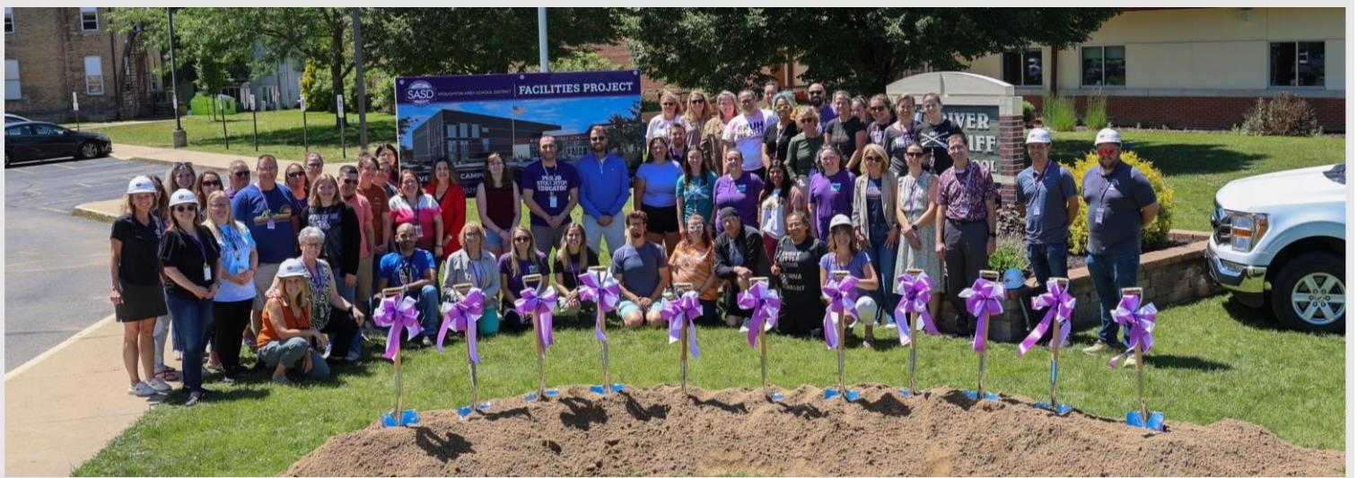
Above: River Bluff staff, school board, and district leadership photographed outside River Bluff Middle School at groundbreaking ceremony June 7, 2024