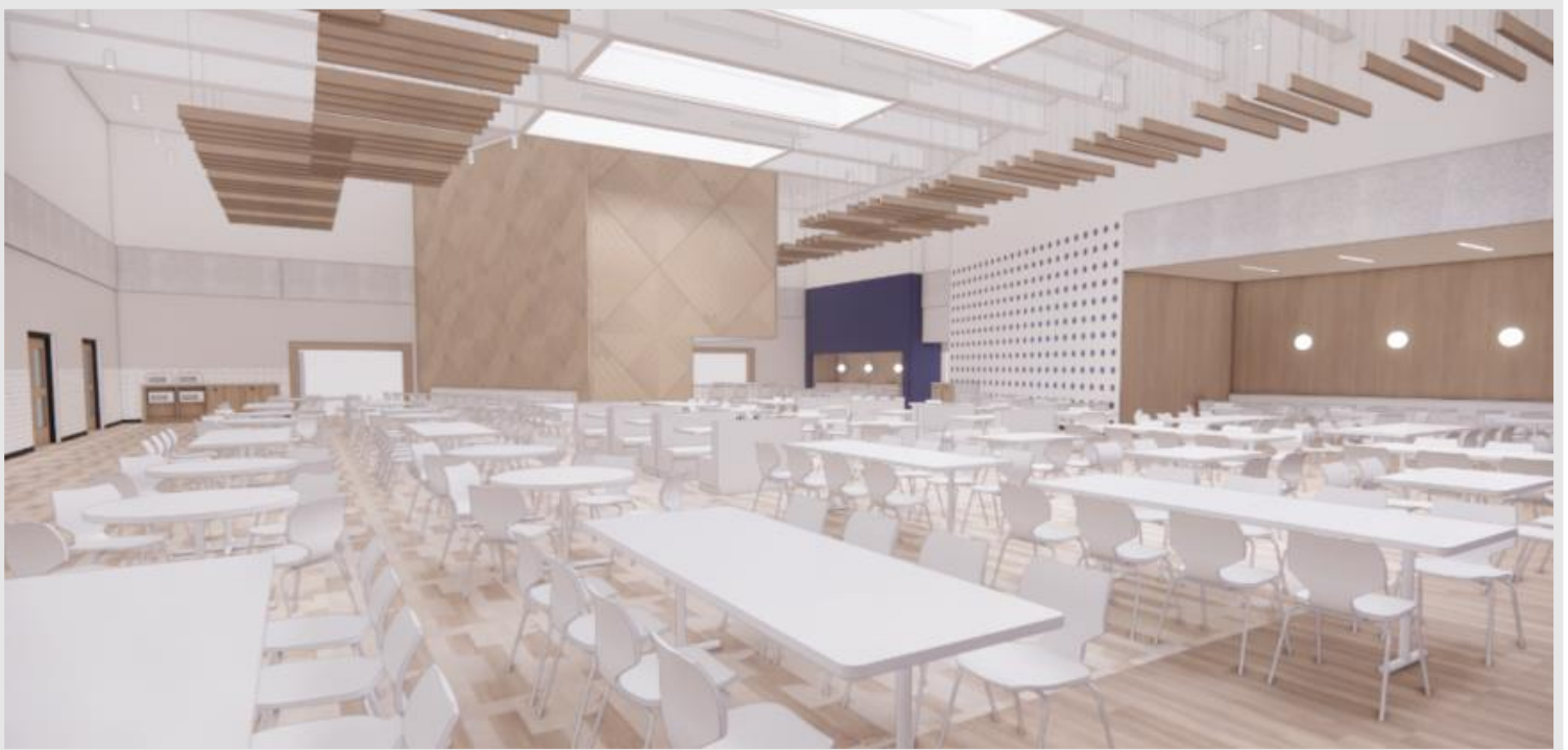
Above: a rendering provided by EUA, the building's architects, of the future Stoughton High School commons space