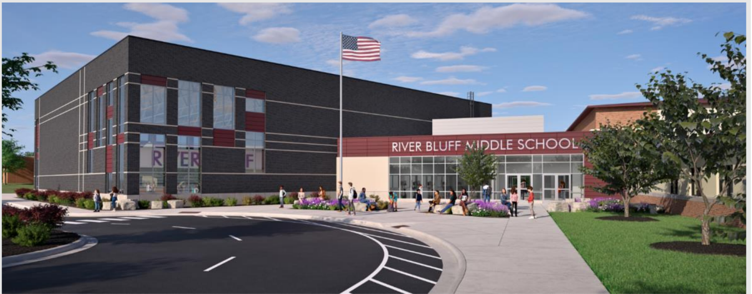
Above: a rendering prepared by the EUA, the project's architects, of the future River Bluff Middle School addition

The River Bluff Middle School athletic facility addition will feature a new gym, wrestling room, fitness room, and restroom spaces. The addition will also incorporate a new main entrance to the school positioned in front of the new parking lot and student drop-off lanes. Following the demo of the existing Armory Building, this project is already underway with the first foundation walls poured earlier this week! The campus will also see upgrades to the District Office that include improvements to the existing mechanical, electrical, and plumbing (MEP) systems, refreshed finishes throughout the office and common spaces, and the addition of a new entrance area that will add an elevator to provide access to all three levels.