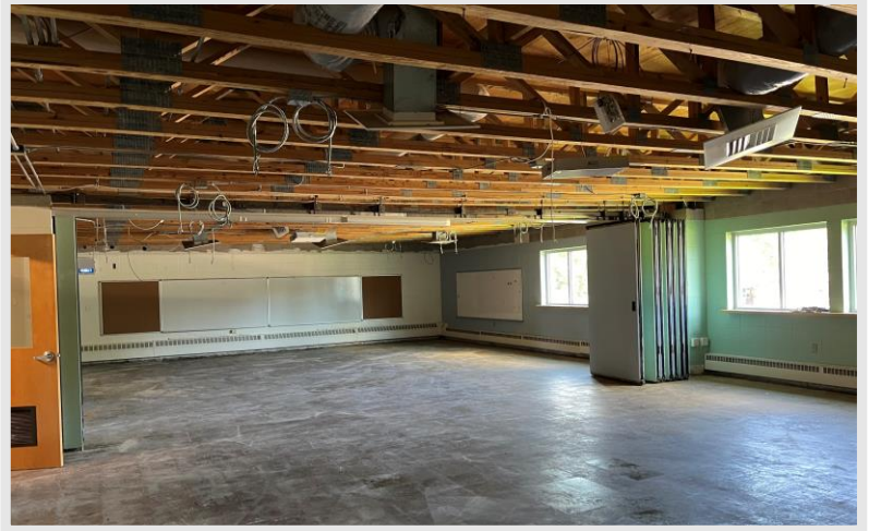
Above: a photo of the demo progress at Kegonsa Elementary

Kegonsa Elementary is set to undergo a complete interior make-over this summer that will rejuvenate the school with new flooring, paint, ceilings, and light fixtures throughout all the classrooms, corridors, and most common spaces. Kegonsa will see MEP upgrades as well that include new drinking fountains, boiler system, cabinet unit heaters, and mechanical air handler and condensing units to cool and manage airflow in the school. The school will also benefit from new doors and frames at most of the building's entrances. All this work will be completed this summer, and the school will be ready for students and staff for the start of the 2024-2025 school year!