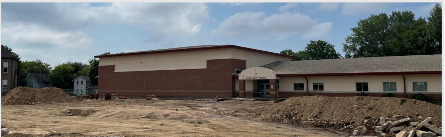
Above: a photo captured of the progress at River Bluff taken at a similar vantage point of the rendering above