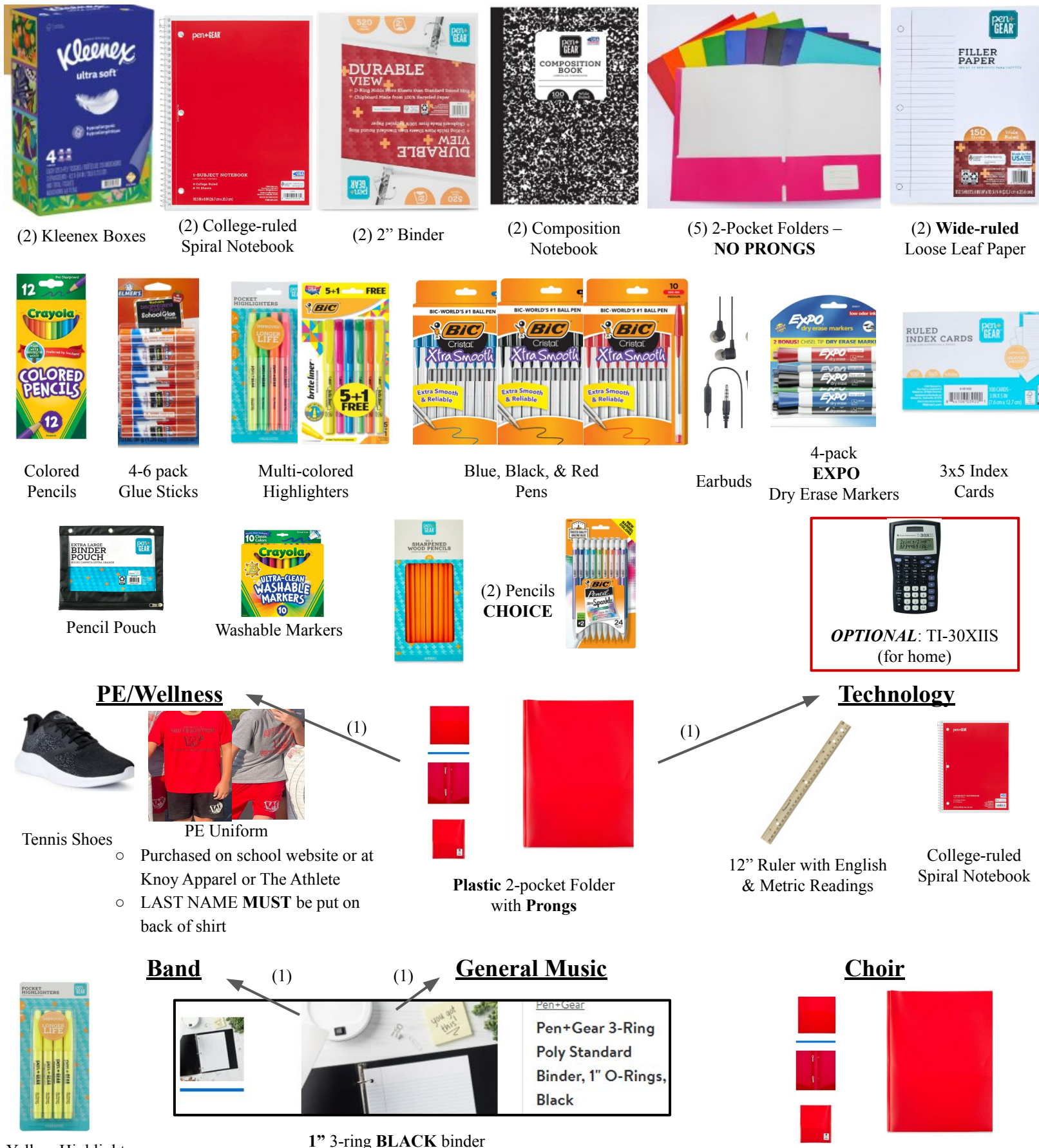
(3) RED Plastic 2-pocket Folder with Prongs