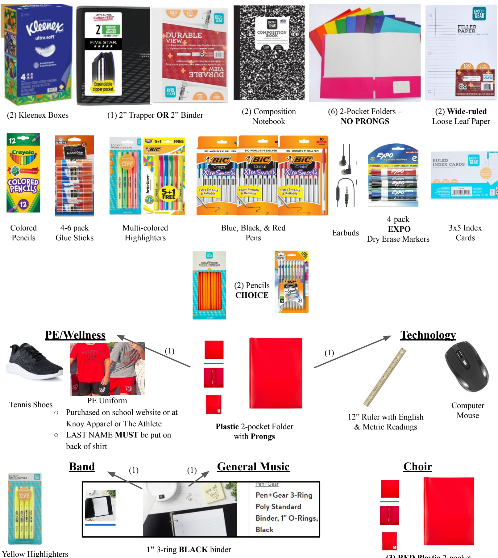
(3) RED Plastic 2-pocket Folder with Prongs