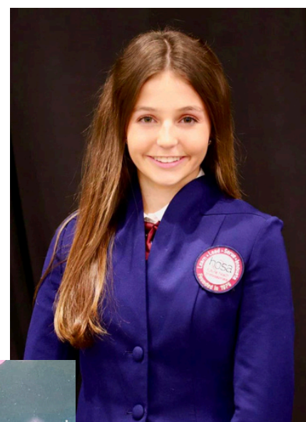
Left: This happy contingent represented CCHS at the national HOSA convention in Houston, along with ..