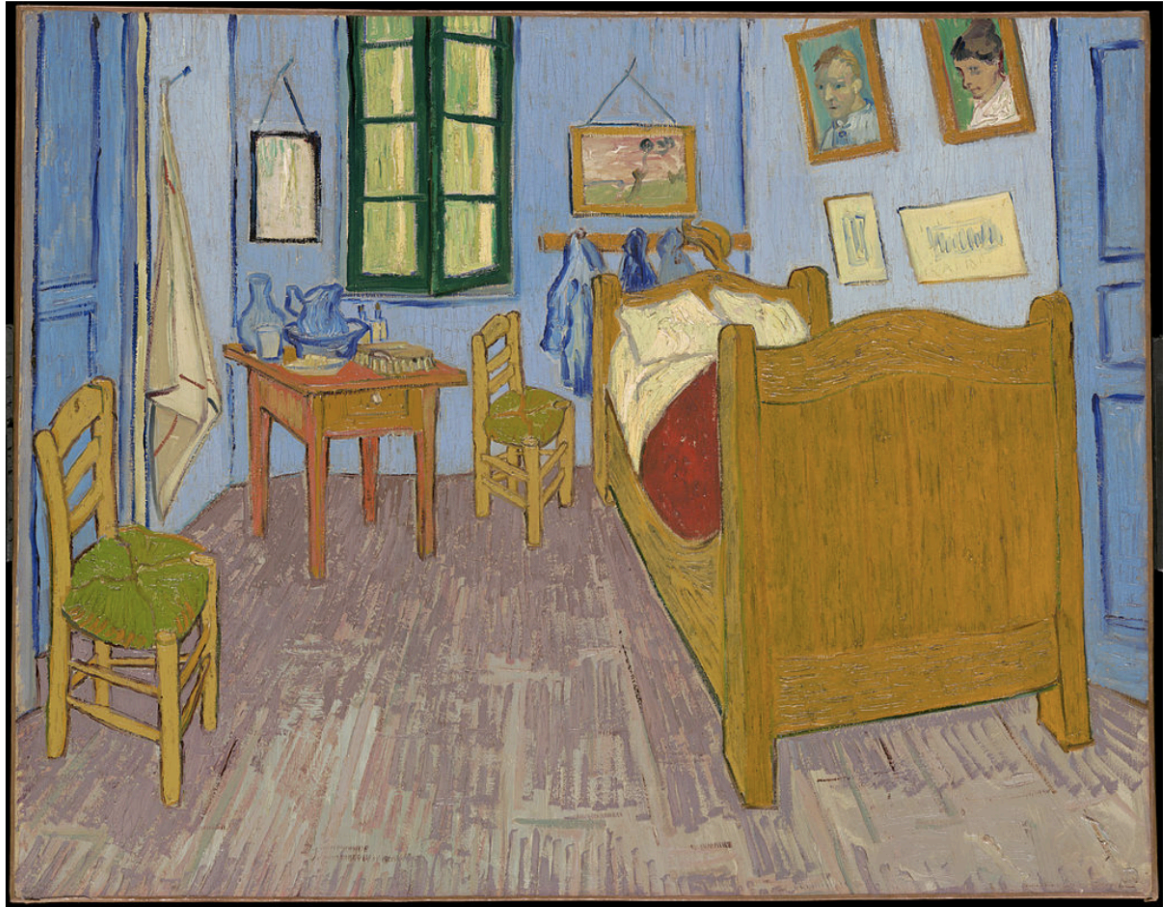
Vincent Van Gogh, Bedroom in Arles (1888) | Image: Fair Use