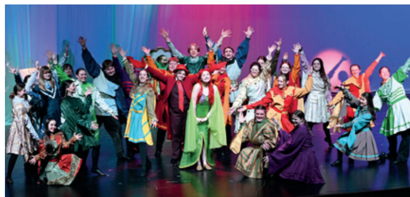
Congratulations to the cast and crew of The Little Mermaid , recipients of several Spotlight Showcase awards by the Hennepin Theatre Trust.