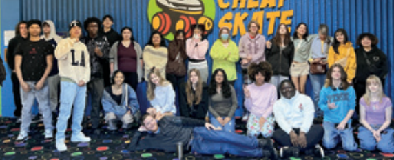
Hard work pays off! After several weeks of focused work on core content, Centennial Area Learning Center students enjoyed a field trip to Cheapskate for some fun relationship-building with peers and staff.