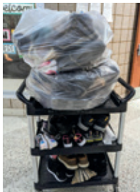
With the supportive guidance of the PTO, Blue Heron Elementary is already looking into growing the Shoe Drive in the fall, promising a bright future for both the school and the environment.

OLD SHOES WITH A PURPOSE The Blue Heron Elementary PTO kicked off an incredible service project that not only brings in funds but also benefits the environment - a win-win situation! The Shoe Drive began its journey in May with everyone at Blue Heron pitching in to collect shoes and contribute to a good cause. The PTO will earn money based on the overall weight of the shoes collected, truly turning old footwear into opportunities! Keep those shoes coming and let's make a positive impact together!