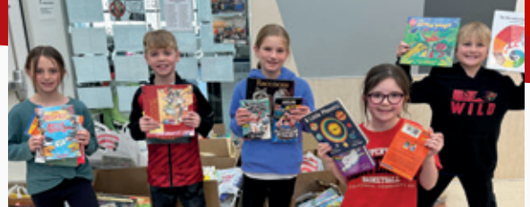
In a heartwarming display of community spirit, the Centerville Elementary Student Leadership Team and the PTA joined forces to spearhead a book drive in support of literacy initiatives across Minnesota.