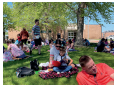
The first-grade team at Centennial Elementary welcomed families to celebrate student progress through their portfolio share. It was a joy to see parents and students engage in meaningful conversations about learning achievements.

FOSTERING A STRONG SCHOOL COMMUNITY Students, families, and staff at Centennial Elementary celebrated experiences and partnerships as the school year wrapped up. The involvement and support of families are invaluable and play a crucial role in fostering a strong school community.