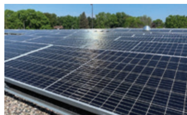
Golden Lake Elementary's solar power production can offset up to 60% of daily usage in the school on a good, solar day.

GENERATING ENERGY In addition to the energy created around the fun of learning, connecting with, and working with others that can be found inside Golden Lake Elementary, you can find energy being produced on the roof of the school, too! The solar project is a partnership with Ideal Energies and is one of 80 schools in 45 districts across the state to receive grants through the Minnesota Department of Commerce for Solar for Schools Program. Students can see first-hand solar power at work and learn about clean energy technology and careers. To date, benefits include 42,614.52 pounds of CO 2 emission saved which is equivalent to planting 322 trees.