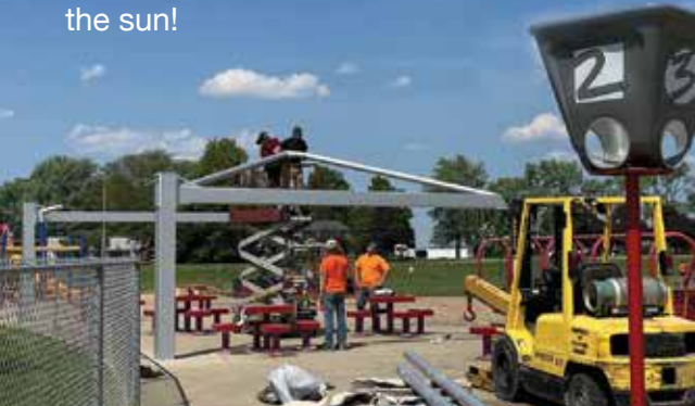
A snapshot of the shade canopy being built!

Students are thrilled about the new addition and look forward to enjoying many sunny days on the playground with a cool, shaded area to take breaks from the sun!