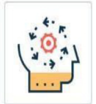
POSITIVE LEARNING ENVIRONMENT