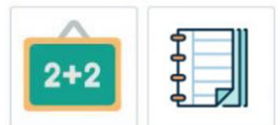
AFTER SCHOOL STRATEGIC TUTORING