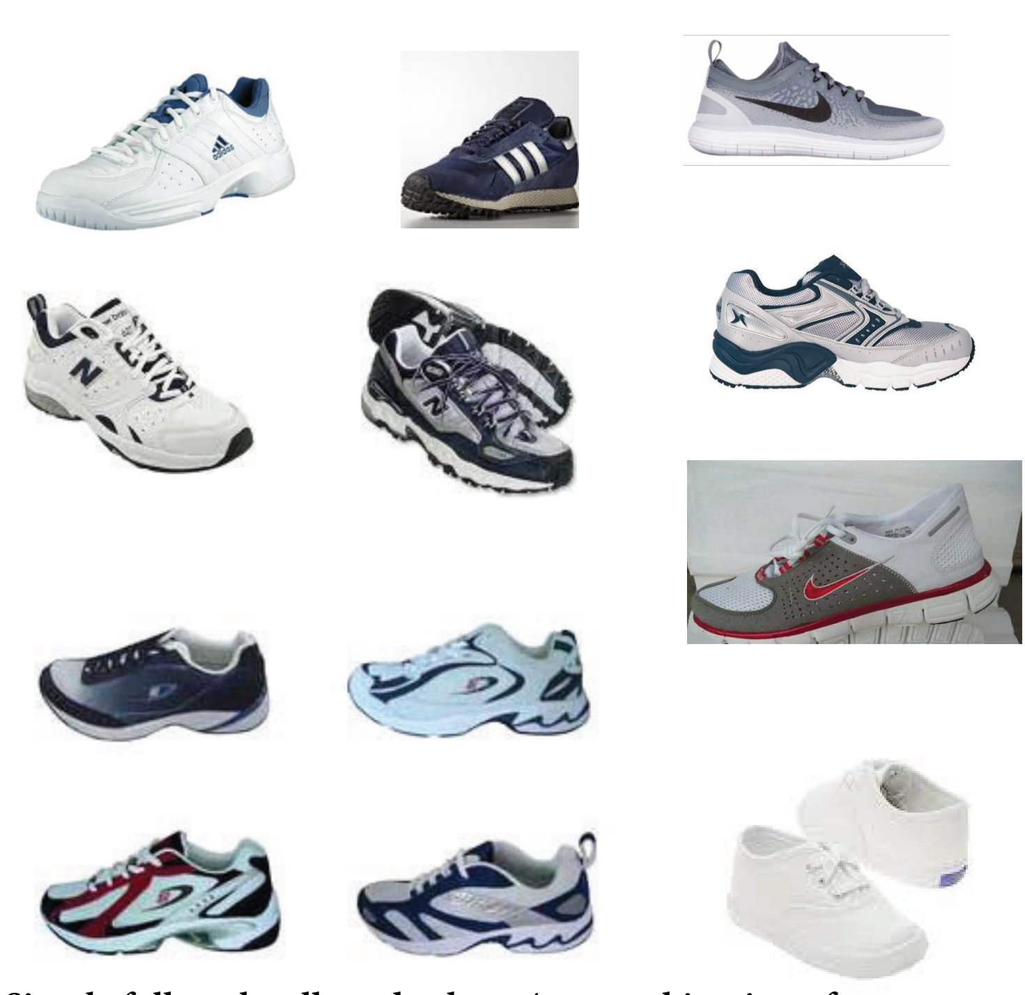
Simply follow the allowed colors. Any combination of white, black, navy, gray and or red on the shoe. No other colors. (Royal blue is not allowed.)

High top and ¾ top tennis shoes will not be allowed. No topsiders, deck shoes or hard leather shoes, boots, patent leather shoes, sandals, jellies, crocs, or shoes with wheels or lights will be allowed.