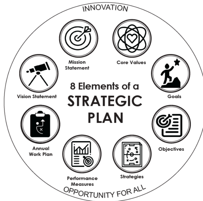
FIGURE 1: Strategic planning elements