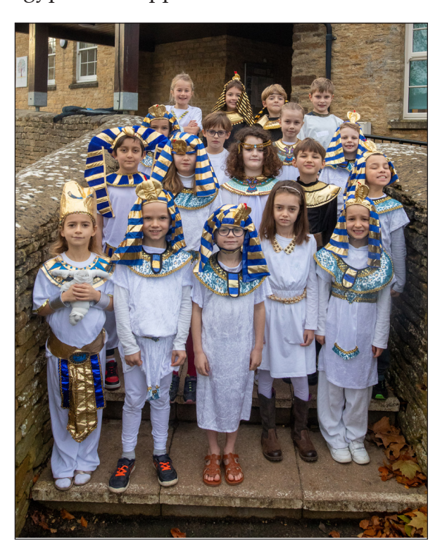
figure - anything which inspires them and sparks their enthusiasm. Children are expected to research their topic (using the skills developed through the spring term Take One project) and prepare a five-minute talk which they present in a format of their choice - this can be supported with a script or prompt cards, a PowerPoint, props, a poster, photographs etc.

Our Topic Talk project is designed to ignite curiosity; deepen subject knowledge in an area of a child's choosing; develop confidence; and practice presentation skills in a nurturing and supportive environment. All Year 3 children are asked to present a topic of their choice to their form group at the end of the summer term. The subject should be a personal interest - this might be a hobby; a favourite animal; a trip they have made; an aspect of family history; a sporting passion; an author, artist, or historical