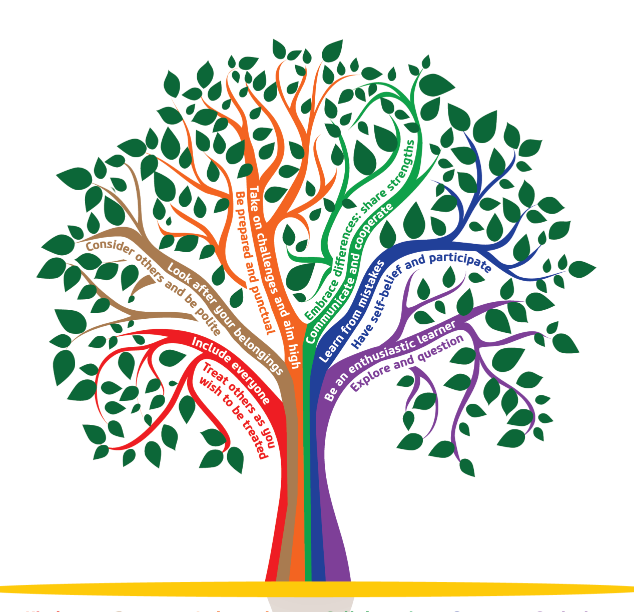
Kindness • Respect • Independence • Collaboration • Courage • Curiosity