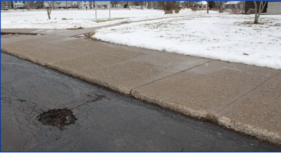
Replace concrete sidewalks and repave Drop Off Loop