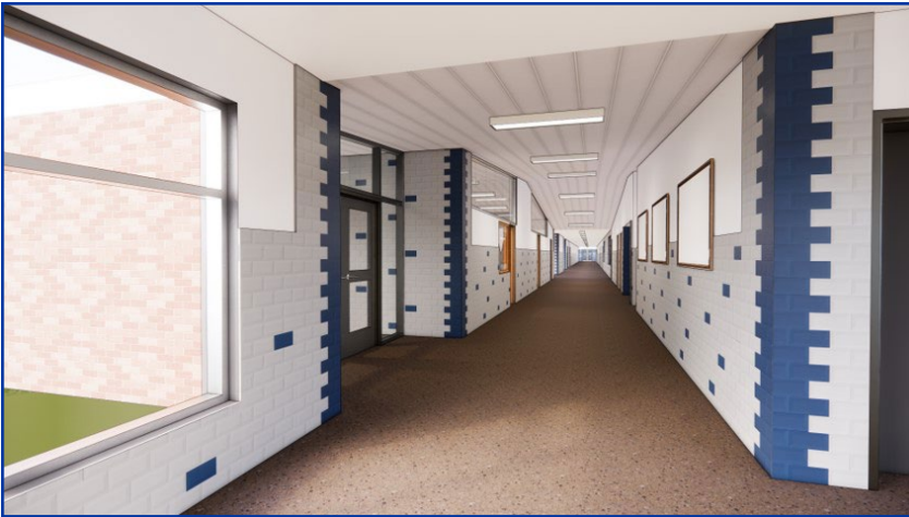
Sample Rendering of New Corridor Finishes