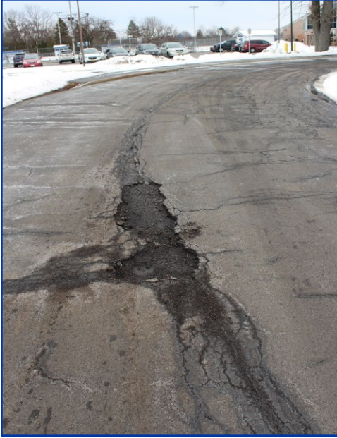
Repave Middle/High School Bus Loop