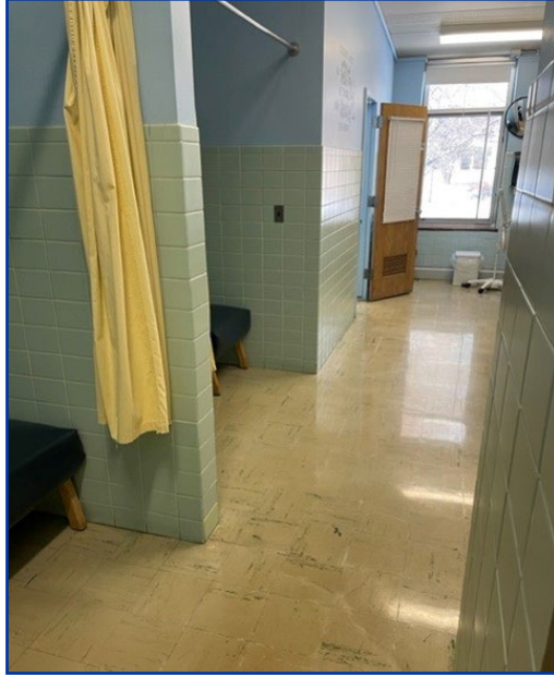
Upgrade Nurse's Suite