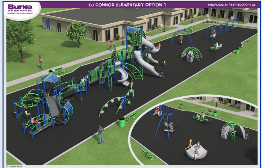
Sample rendering of new T. J. Connor playground