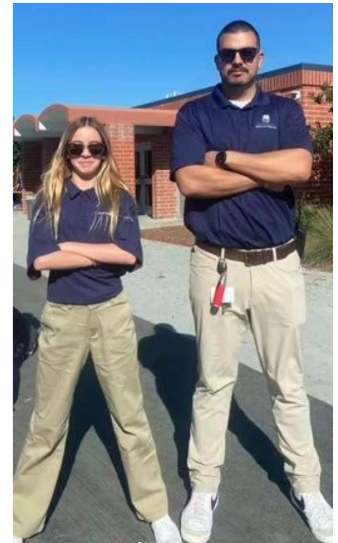
Student Left: spirit day

I love building relationships with students and seeing them grow over the course of the year.