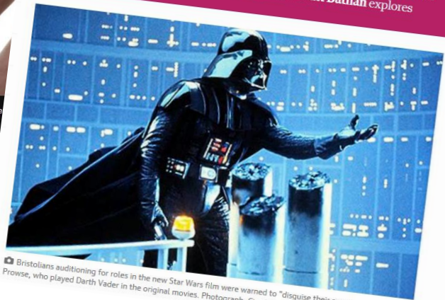
Bristolians auditioning for roles in the new Star Wars film were warned to "disguise their accents" by David Prowse, who played Darth Vader in the original movies.