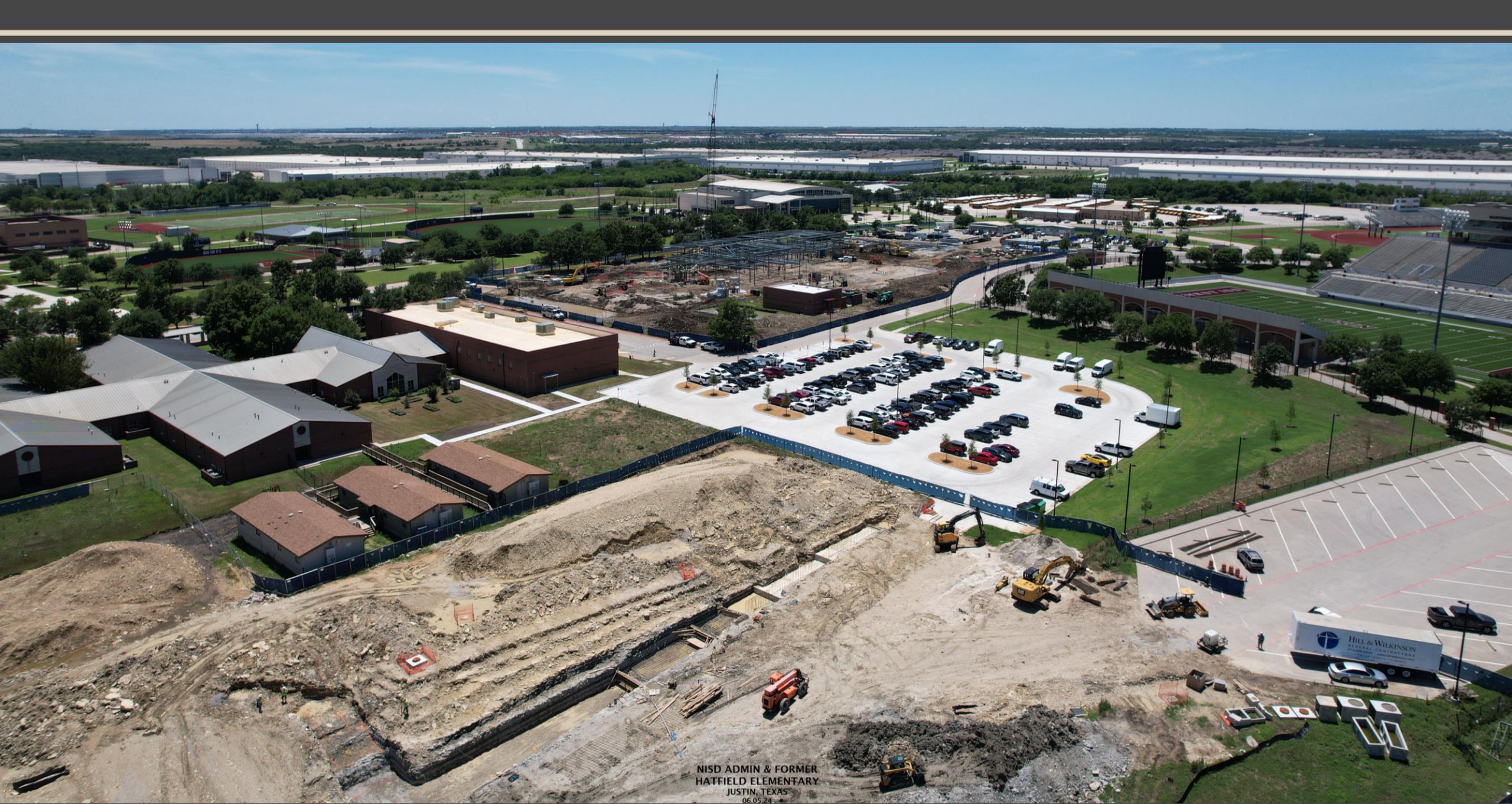
NISD ADMIN & FORMER HATFIELD ELEMENTARY JUSTIN, TEXAS 06.05.24