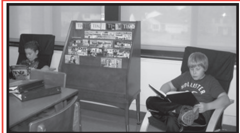
Students enjoy new reading chairs purchased through book fair profits.