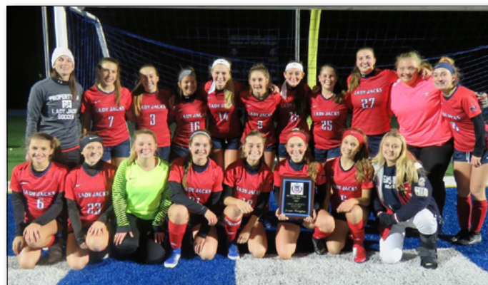
NT Girls Soccer team poses with NFL plaque after their win.