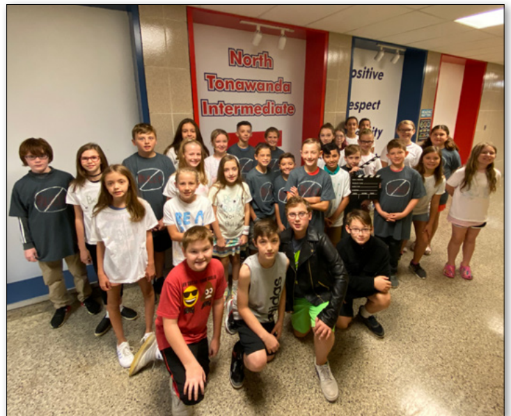
Movie Crew in NTI hallway.

As part of the North Tonawanda Intermediate School’s two week campaign centered on “Junior Jacks Choose to be Kind”, a group of sixth graders came in before school for two weeks straight to work on a “Don’t Bully” video. The video was shown to everyone in the NTI building during Fall Festival on November 1st.