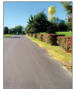
NEW HIGH SCHOOL ENTRANCE