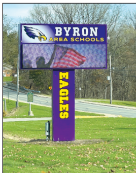
NEW ELECTRONIC SIGN