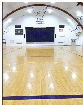
REPAIR AND PAINT ELEMENTARY GYM INTERIOR