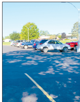
PAVED STUDENT PARKING LOT