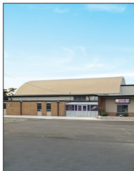
NEW ROOFING INSTALLED OVER THE ELEMENTARY GYM