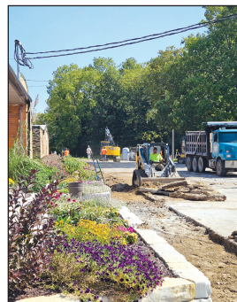
CONCRETE WORK AT THE ELEMENTARY SCHOOL