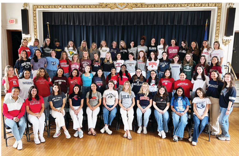
Congratulations to the Class of 2024 who received acceptances to 142 colleges and universities and will matriculate to 49 different campuses in the Fall.

New this Year! In addition to our fantastic enrichment camps, Summer@Lauralton will be offering sports camps for rising 5th through 9th-grade girls led by Lauralton's coaches and players. Register now: lauraltonhall.org/summer