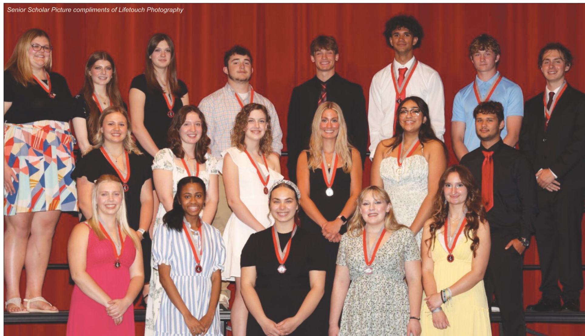
Senior Scholar