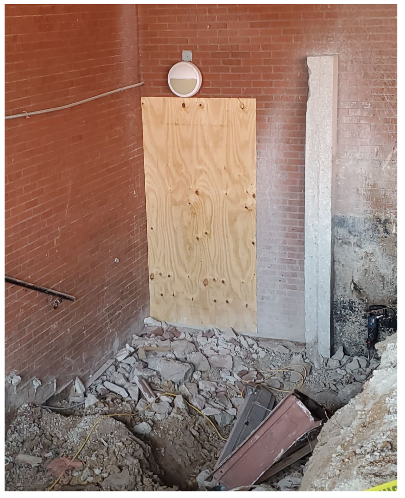
Week Ending June 21, 2024