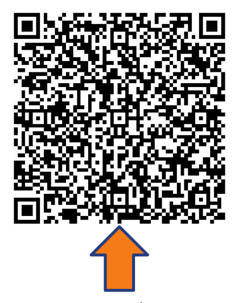
Presentacion en Espanol