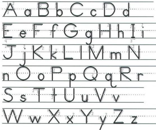
How to Print Letters