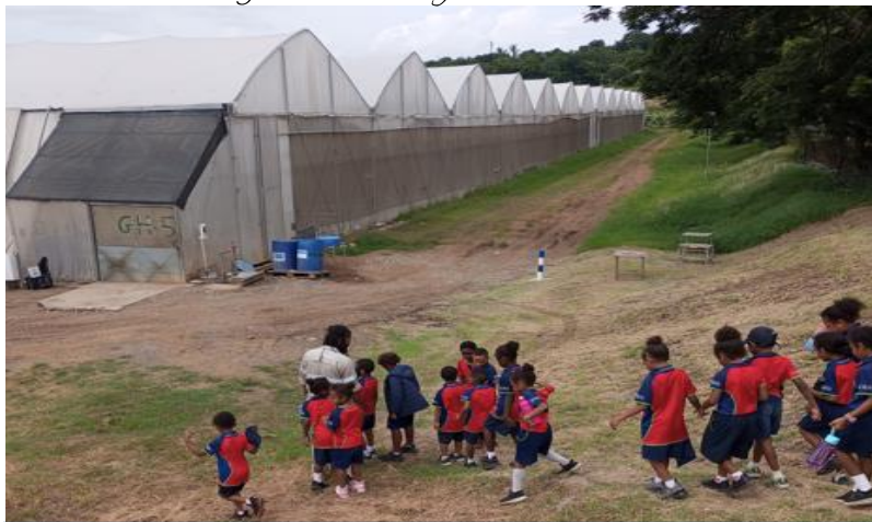
Visit to the green houses

Innovative Agro Industry and ILIMO Farms