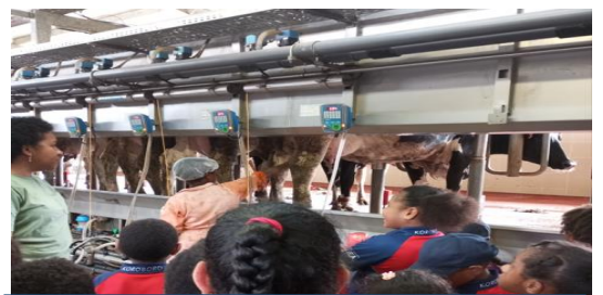
Milking cows at ILIMO Farm