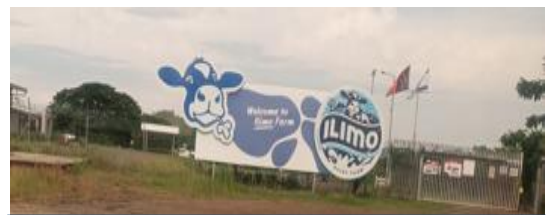
Entrance to ILIMO Farm