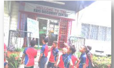
Taking a tour of the Koro Campus Week!