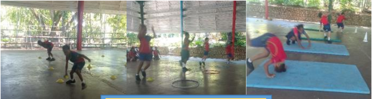
Gymnastic Lesson in pictures

The outcome of our educational journey was incredibly rewarding, witnessing the transformation of students from beginner's athlete to confident ones, with tangible evidence showcased during our cross-country carnival in week 7