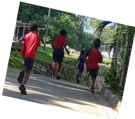
Cross Country lesson in pictures