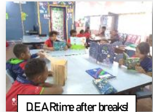
DEARtime after breaks!