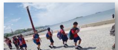
Inquiry Excursion: On a mission to the old Parliament House!