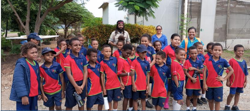
Class photo with the farm staff