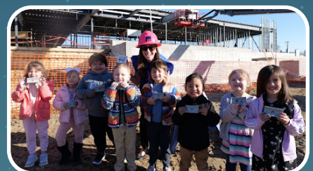
West pre-k ambassadors attend the school's Topping Out Ceremony to celebrate the installation of the last beam in the new school.