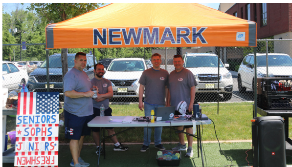
We are so lucky to have fun planners!

Newmark High School students had a great time on May 24 participating in a favorite annual Newmark tradition - Field Day! There were lots of fun and challenging activities, and even perfect weather! The competition was fierce ... but the Seniors won!