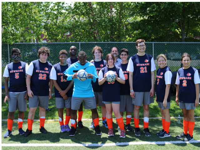
Our soccer team had a great day on the pitch!