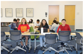
Pay to Play