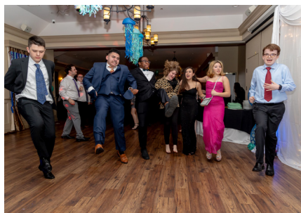
Everyone was having an awesome time dancing!