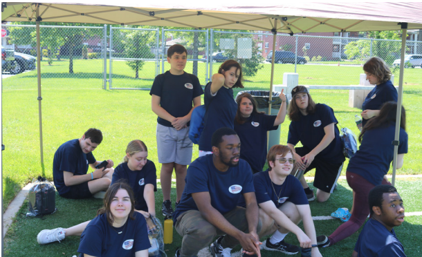
Seniors chilling in the shade