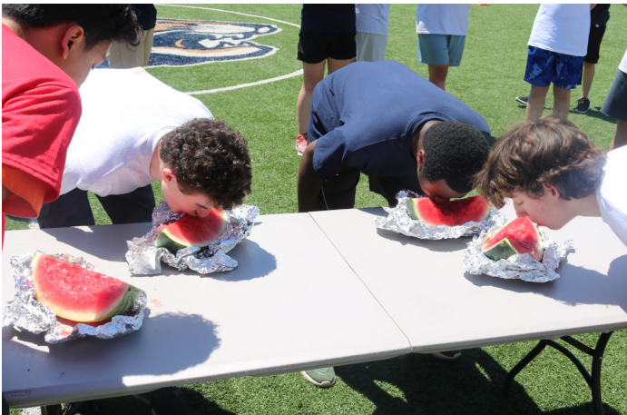
Watermelon eating contest