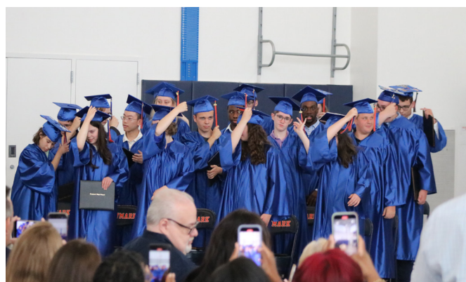
The turning of the tassels!