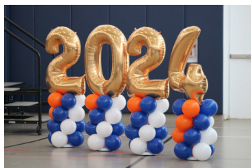
Congratulations Class of 2024!