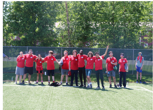
Sophomores working together