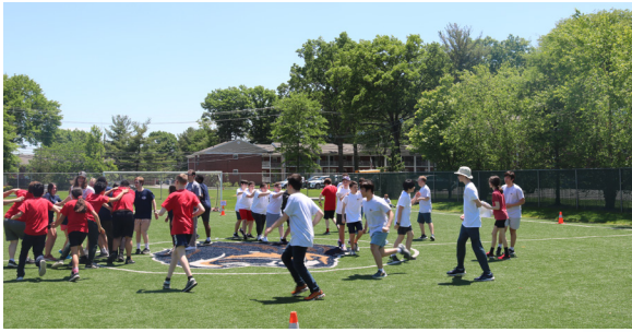
Field Day fun