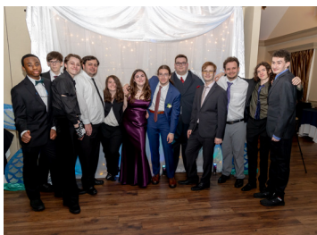
Students had a great time at the dance!