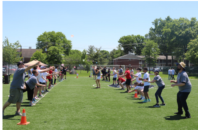
Water balloon toss