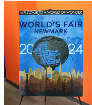
The World's Fair 2024 took place in the gym

On May 29, 2024, the Newmark Schools held their first World's Fair. Students, parents, and staff had the opportunity to travel around the world to explore new cultures, learn about the rich histories of many countries, and sample new and interesting foods. Students began preparing their projects and working together with their partner classes months in advance and were able to participate in an individualized and differentiated fashion. It was a collaborative effort between our K8 and High School classrooms, and it was an amazing day of learning, eating and celebrating the differences of countries from around the globe.