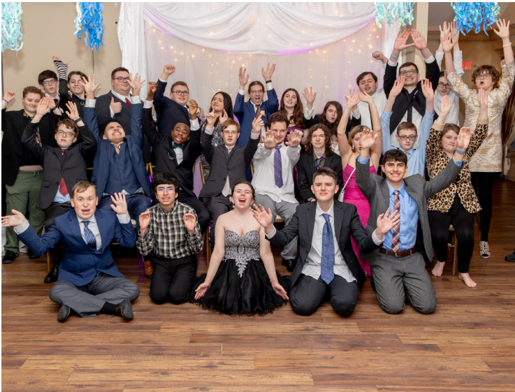
The whole crew having a grea time at the dance!