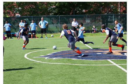
Newmark soccer team going for the goal!