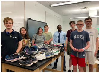
Soles for Souls