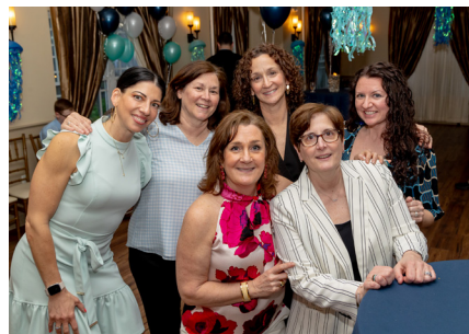
Chaperones can have fun, too!