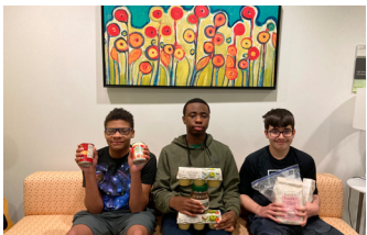
School Store Drive