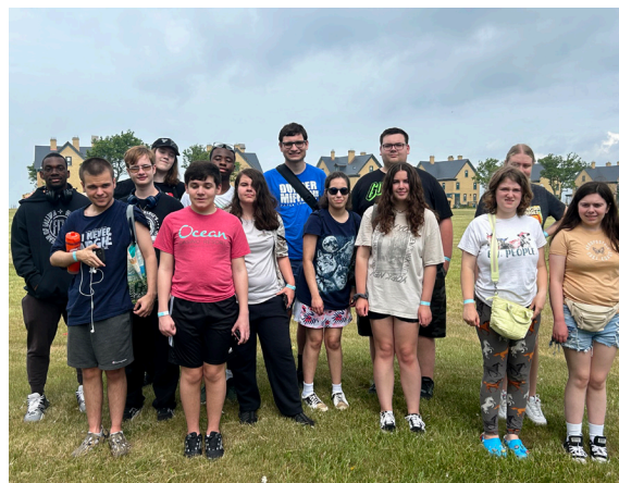
Some of the Seniors enjoying the sunshine and ocean breeze at Sandy Hook