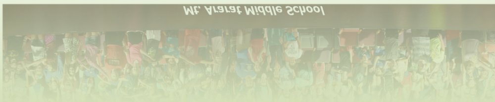
Mt. Ararat Middle School