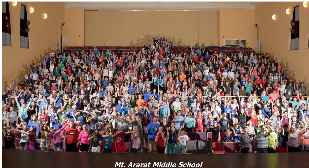
Mt. Ararat Middle School