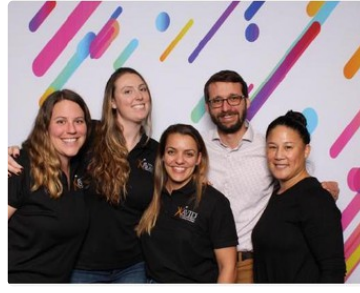
Tam Staff at AVID National Conference!