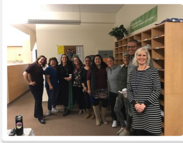
Getting Ready to Greet you in 2020!