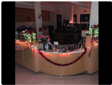
Hi-lights from the Holiday Season!