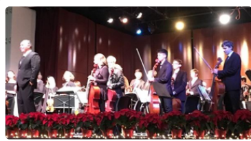
Holiday Instrumental Concert