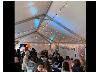
Winter Art Faire