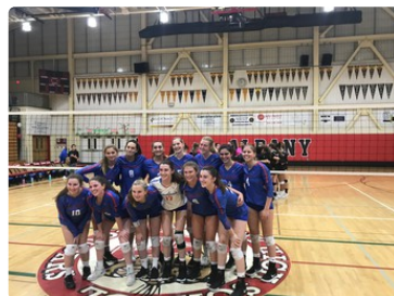
Girls Volleyball Team!