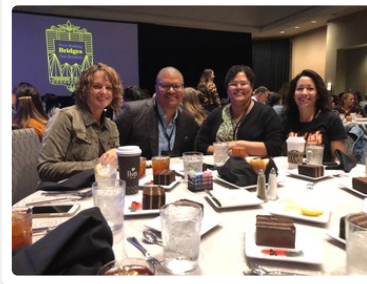
District Receives Award