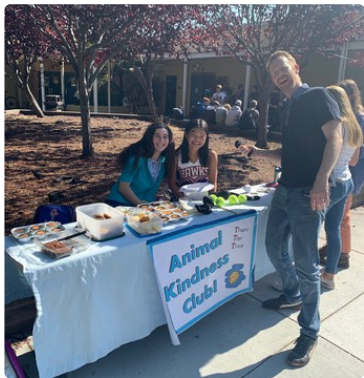
Animal Kindness at Tam Unity Day!

Congratulations to Students Organized for Anti-Racism (SOAR) for receiving the Ruby Bridges Award at the National Summit for Courageous Conversations in New Orleans, Louisiana. We are proud of the work SOAR has done in organizing Breakthrough Day and creating student led workshops.