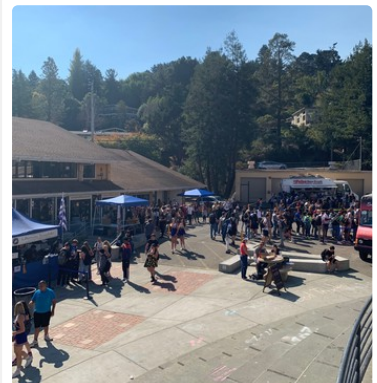
Plenty of Food to Choose From!