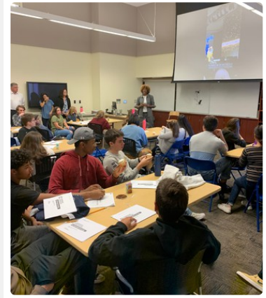
SOAR at Work!