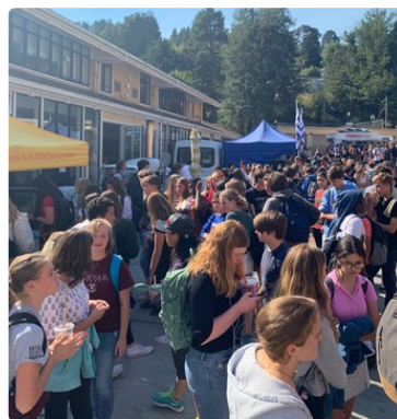
Tam Unity Day!