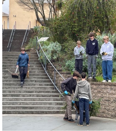
Campus Clean up!