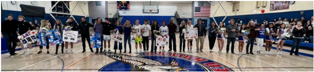
Senior Basketball Night