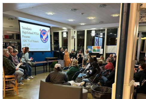
Parent Education Evening-ABC's of Honors/AP