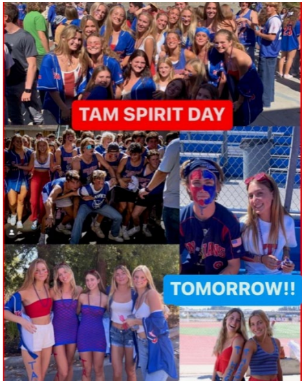
Reset Spirit Week and Rally