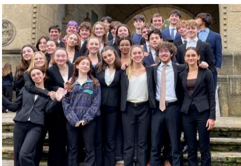
Tam High Mock Trial