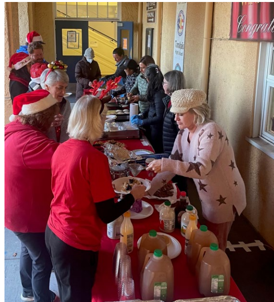
Friday morning pancake breakfast-thank you PTSA!