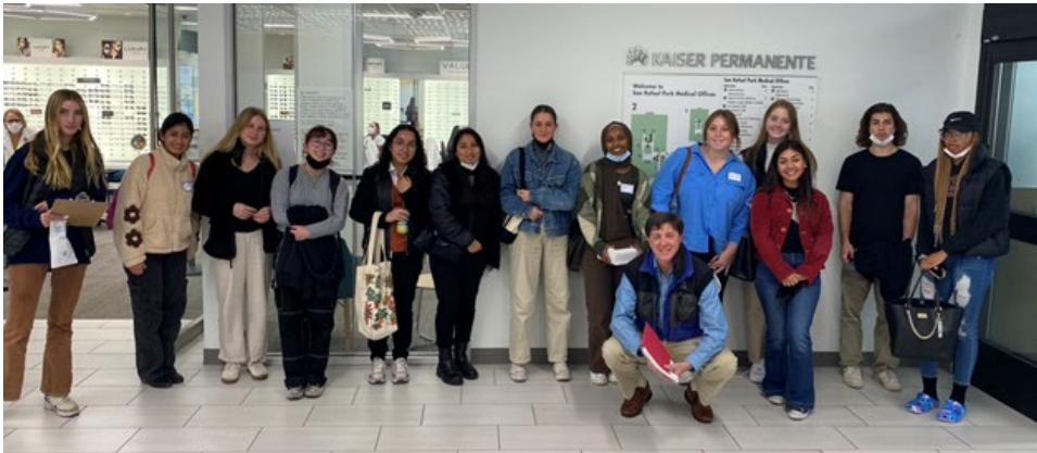
School to Career Field trip to Kaiser!