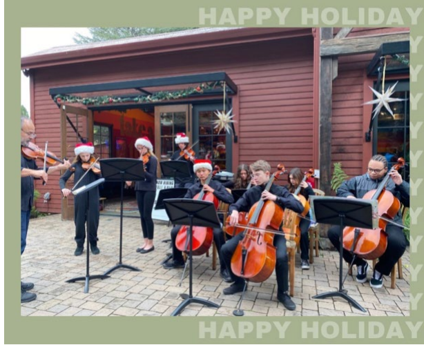
Tam High Holiday Music!