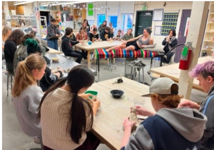
Thanks to THF grant, intermediate & advanced ceramics final!