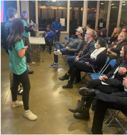
Tam High Prospective Student Night