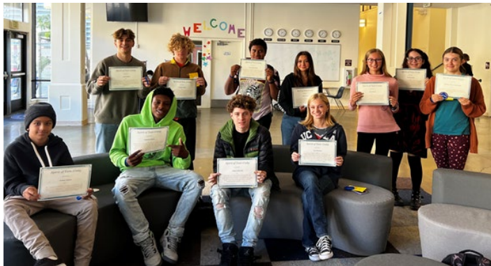
Spirit of Tam Unity Awards!