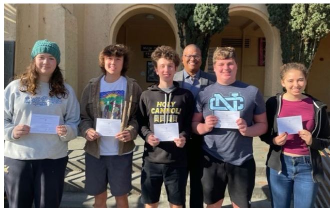
National Merit Scholars!