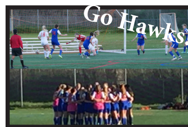
Tam soccer started MCAL play with 2 huge wins over Redwood!