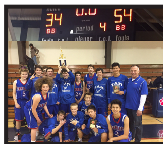
Tournament Champs... Tam Frosh Boys and Girls basketball