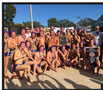
Boys Water Polo Wins NCS!