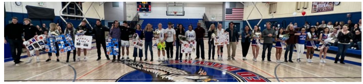
Senior Basketball Night