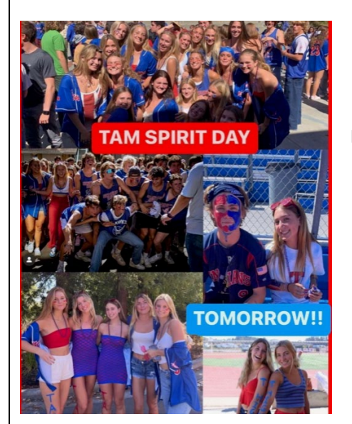
Reset Spirit Week and Rally