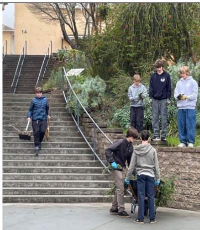
Campus Clean up!