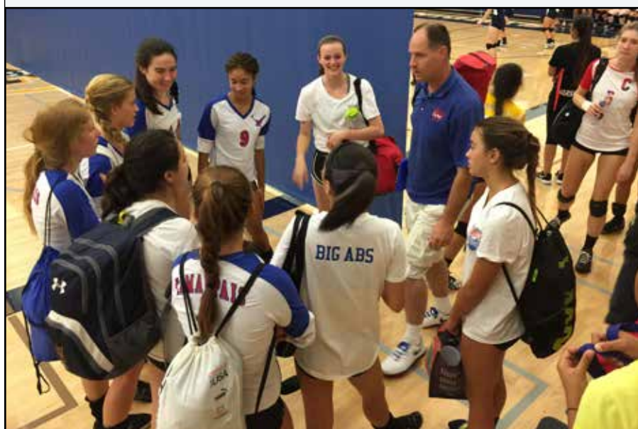
Girls' Varsity Volleyball