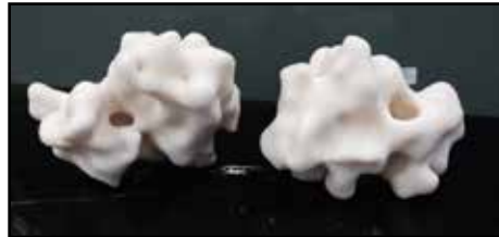
Enzyme models printed by the 3D printer.