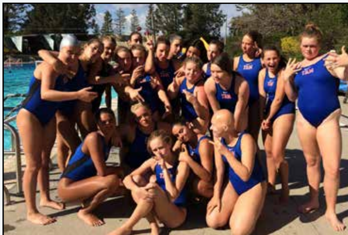
Girls' Water Polo

All athletes must complete a yearly physical to be cleared for sports. Fill out part of your form online here: https://docs.google.com/forms/d/1l4h338DTVrovumN_KDaSi-3Hbh26IOpEFZfnWWk2zs/viewform