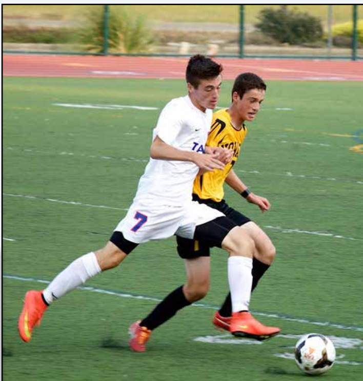
Boys' Varsity Soccer vs. Terra Linda