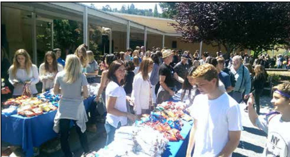
Students and parent volunteers at the freshman BBQ

If you want to receive PTSA emails, be sure to join our email list here: http://bit.ly/JoinTamPTSAList