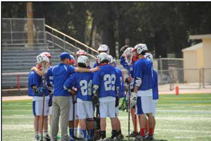
Boys' Junior Varsity Lacrosse vs. Burlingame