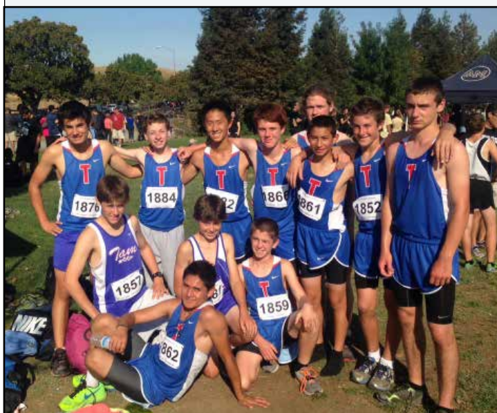
Boys' Cross Country