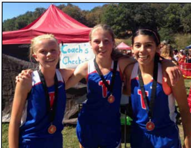
Girls' Cross Country