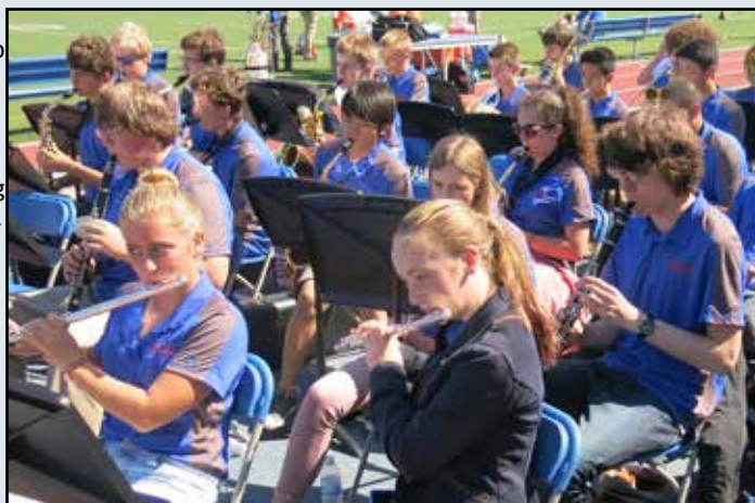
The Tam Band rallies the crowd at the Homecoming game against Redwood.