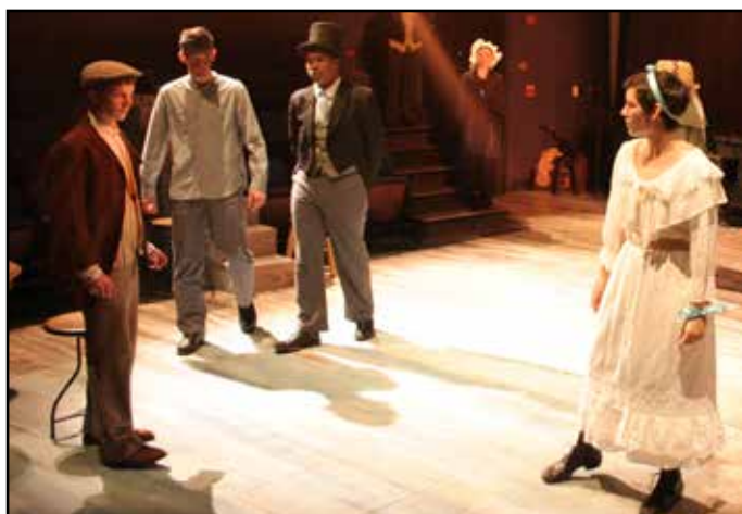
CTE performance of Great Expectations.

Far in the upper reaches of Caldwell Theatre is a room you've probably never seen. It's filled with computer stations and desks, and cluttered with paper. At five o'clock on this Wednesday afternoon there's a pleasant buzz of productive activity as a half dozen students work on the computers and bounce ideas around. This is the hub of CTE's technical operation. It's where sets and costumes are designed, sound and lighting plans devised, and props researched and sourced.