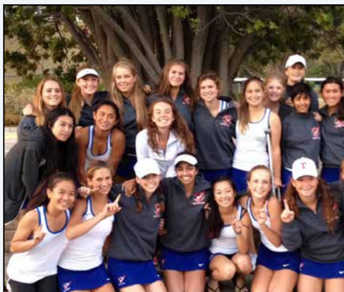
Girls' Varsity Tennis