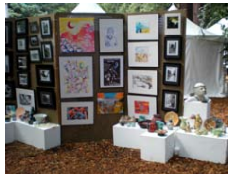
A variety of pieces on display at Tam's booth at the Mill Valley Fall Arts Festival last month.