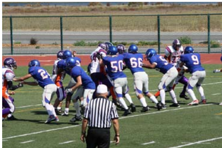
Tam's offensive line holds Galileo's defense in check