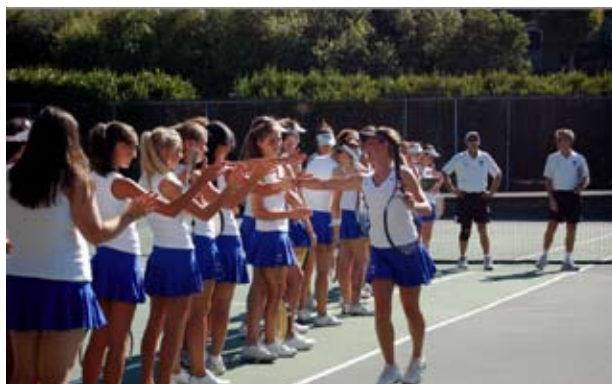
Tam High Girls Tennis team after winning a match against Redwood.

For game schedules, scores and more photos, go to tamhighathletics.org - GO HAWKS! ❖