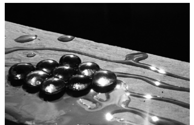
Photographs from student AP Photography portfolios. Top row: Alyssa Miller; middle row: Dane Holt; bottom row: Moises Valencia.