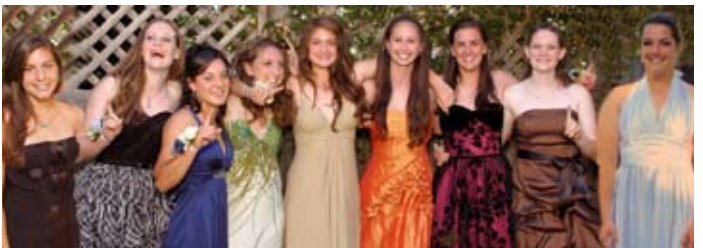
Above: NCS champions. Below: Soccer seniors clean up for their senior prom which occurred the day after they won the NCS title for the second year in a row!