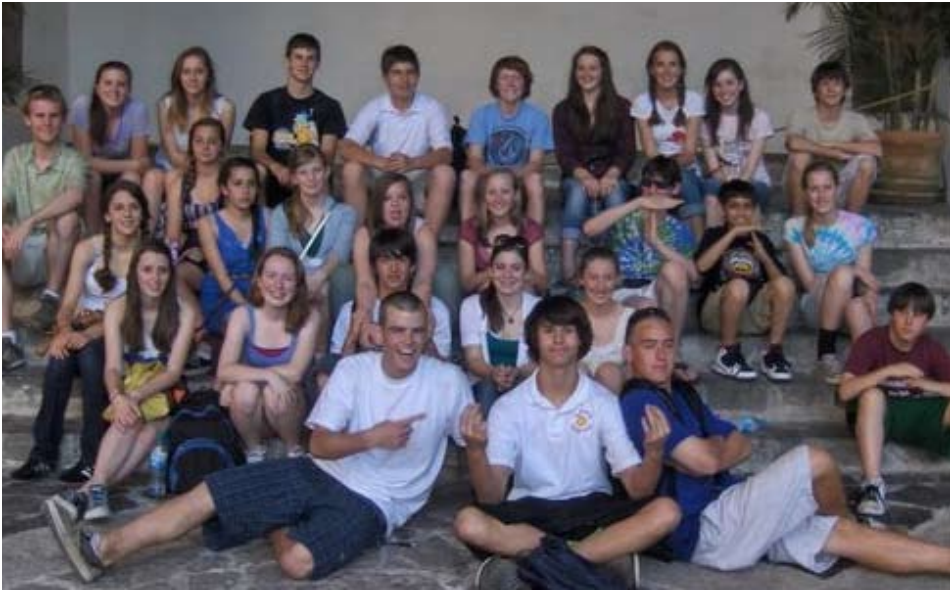
Students in the 2009 Mexico intensive academic Spanish program at the “Open Chapel” in the cathedral area of Cuernavaca, Mexico.