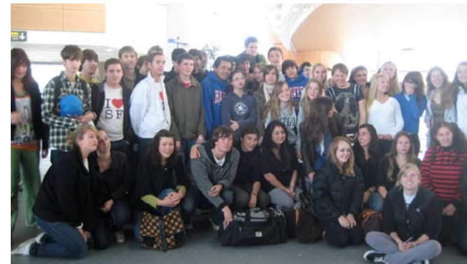
Tam students and Gaston Fébus students say goodbye to each other in France (April 2009).

Six months later, the Tam students fly first to Paris and then to Pau, where they are reunited with the Frenchies in the southwest of France. Their time is spent immersed in the French language, attending French high school, visiting the Pyrenees and Basque country and of course, eating wonderful food. Tam students have the opportunity to improve their French in this area of France where very few people meet Americans. After ten days everyone says goodbye at the Pau airport and the Tam students return to Paris to spend an additional four days exploring the city before returning to San Francisco.