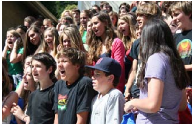
Next year’s freshmen practice their class cheer in Mead Theater.