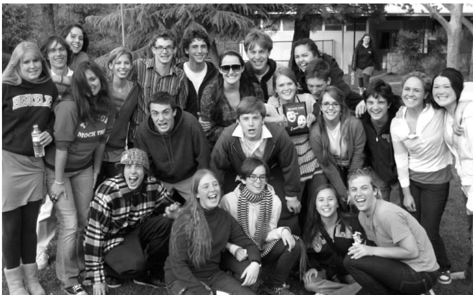
The CTE Motherlode ensemble after performing at the Festival.