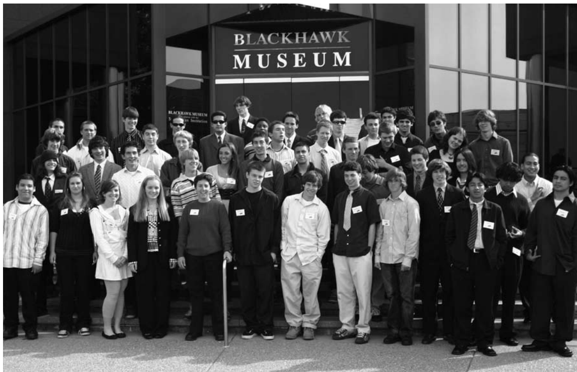
Tam auto shop students looking sharp out in front of the Blackhawk auto museum.

Thanks, too, to the Tam High Foundation for generously supporting the work of the College and Career Center. The generosity of the Foundation allows me to attend seminars, purchase books and learn more about colleges that are of interest to Tam students.