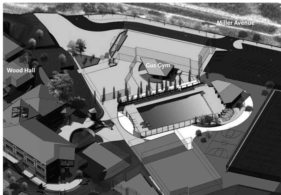
This artist's rendering shows the location of the new pool and Keyser hall.

The construction has been a long time in coming and not without its inconveniences for teachers, staff, students and parents. But those memories are sure to fade as we all enjoy the improved campus facilities.