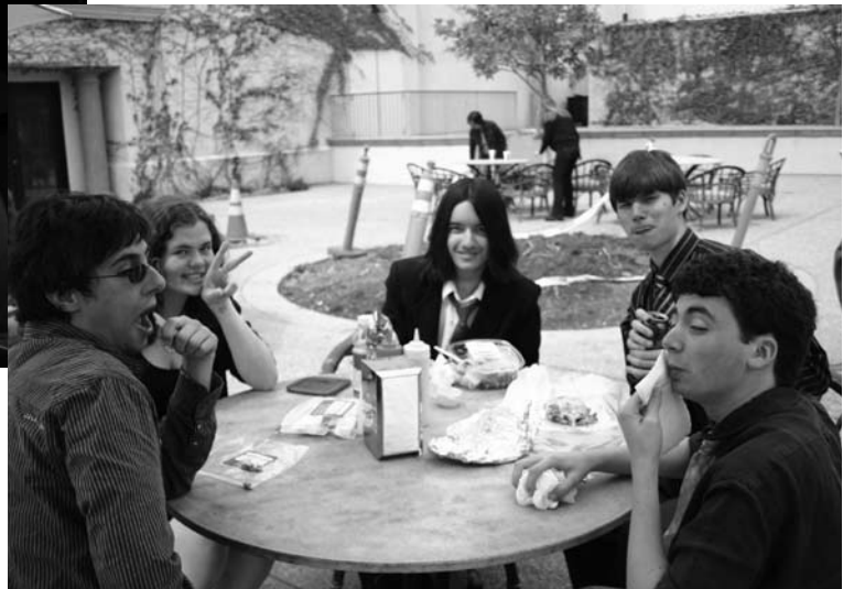
Scenes from a field trip: auto shop students at the Blackhawk museum.