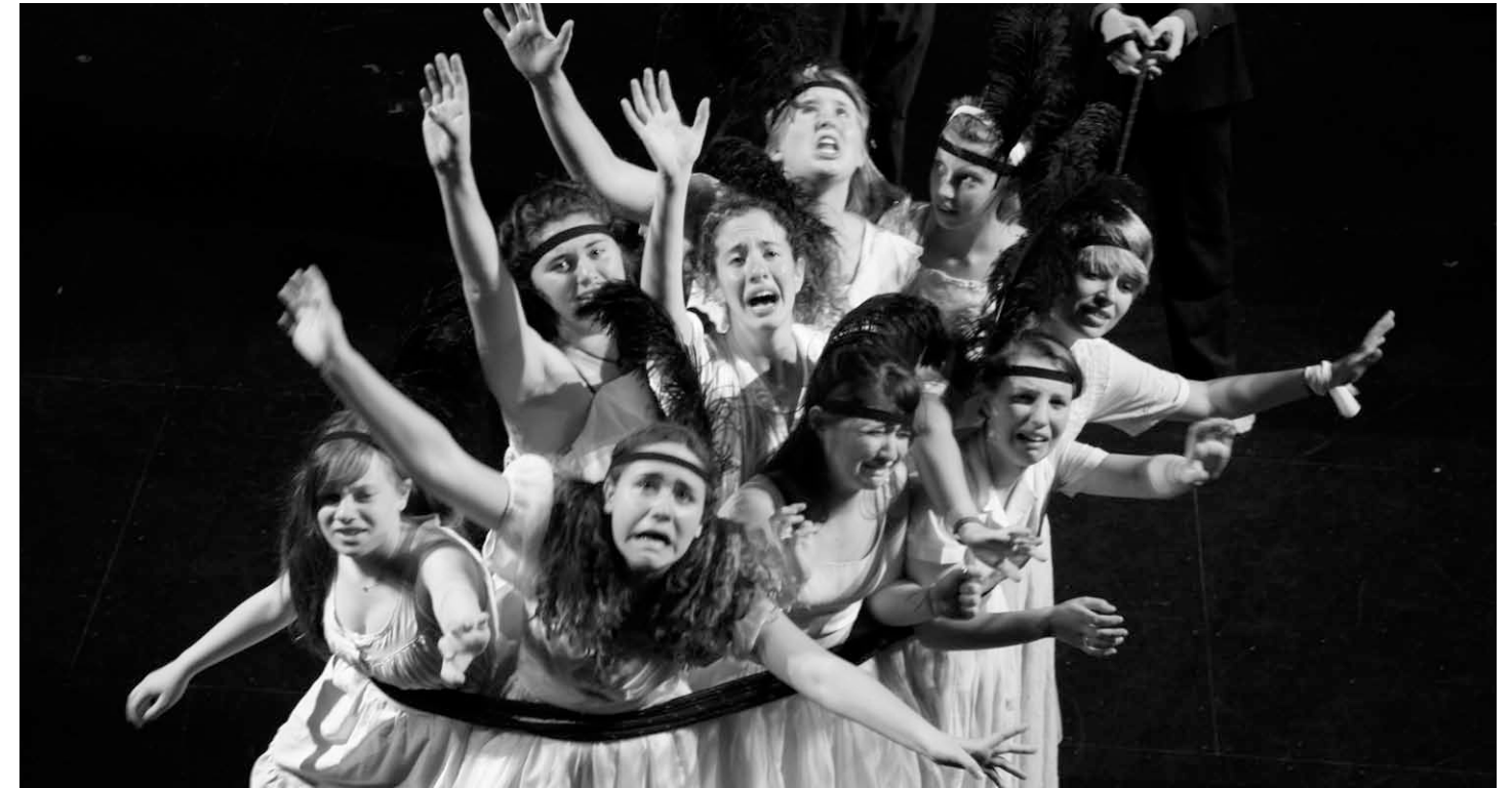
Advanced Drama actors in action.