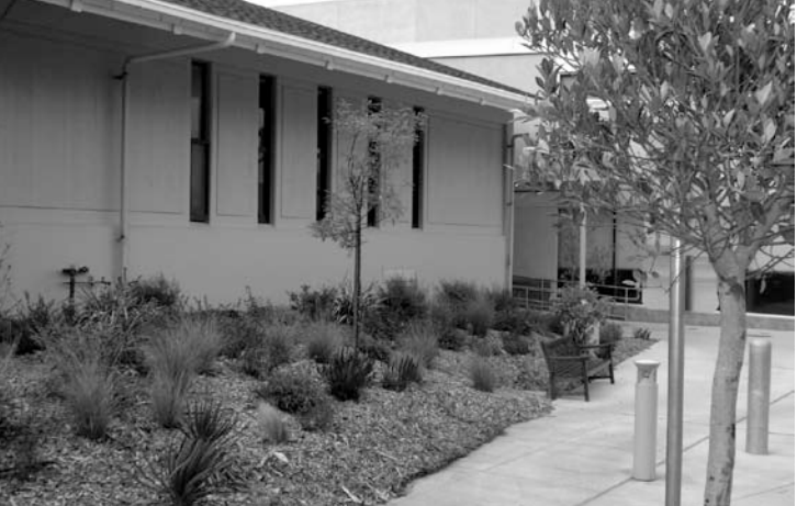
A beautiful native garden emerges from hard-working students and parents.

Not only is this a new year at Tam but it is also an old year ... the Centennial Year at Tam. We’ve been trying to spruce up the campus gardens for the year’s celebrations and will continue, with your help, to do that this year.