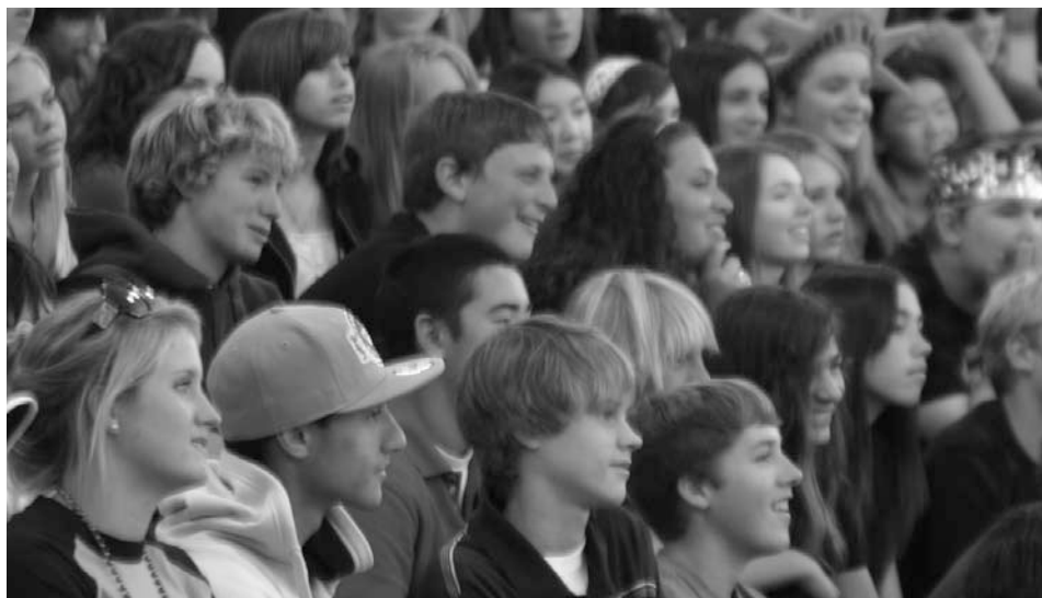
Freshmen and their Link Crew advisors listen to a presentation at freshman orientation.