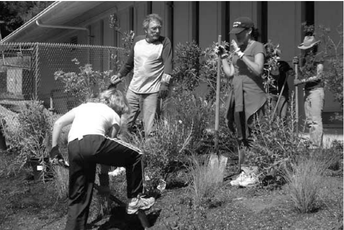
Tam parents help install the new garden behind the Student Center.