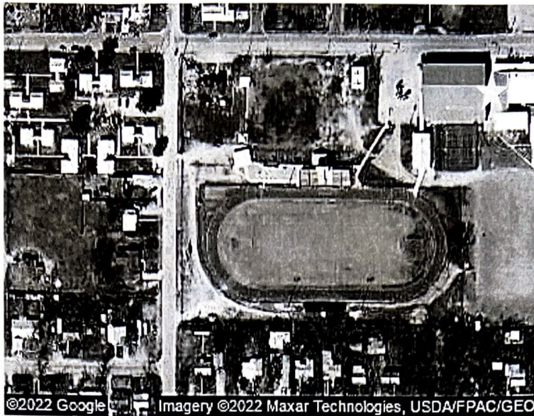
TRAINING ROOM IN ALLEY BETWEEN NEW GYM AND ROCK GYM (SEE STAR)