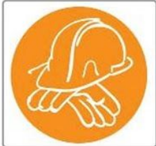
BUILDING & TRADES